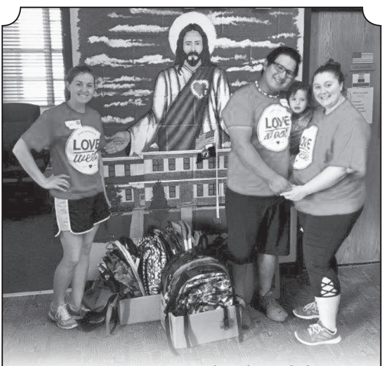
Fountain Springs members dropped of 30+ backpacks for our guests.

the paint and primer! In addition, a group of their members dropped off 30+ brand new backpacks to 30 Main. Backpacks are an often requested item and for our guests to receive a new one is such a treat! We want to thank Fountain Springs for the time, generosity and friendship they continue to extend to Cornerstone! We are so thankful to be part of the Fountain Springs circle of friends!